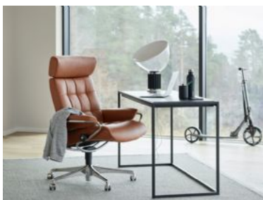
Office Chair w/ Adjustable headrest 122cm(w) 43cm(h) was £1968 Sale from £1569