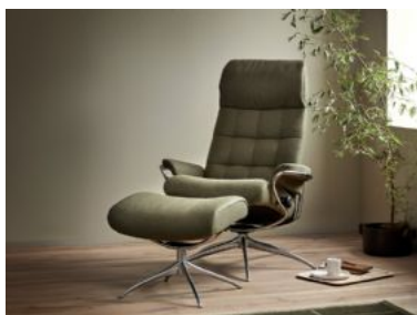
Star Base Recliner Chair w Stool was £2299 Sale from £1829