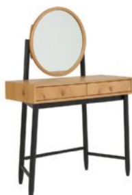
Dressing Table 96cm(w) 137cm(h) 45cm(d) was £930 Sale from £739