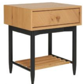
1 Drawer Bedside Cabinet 50cm(w) 58cm(h) 46cm(d) was £405 Sale from £319