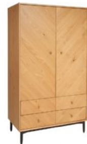
Double Wardrobe 110cm(w) 193cm(h) 60cm(d) was £1925 Sale from £1529