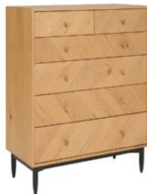
6 Drawer Chest 95cm(w) 123cm(h) 46cm(d) was £1450 Sale from £1155