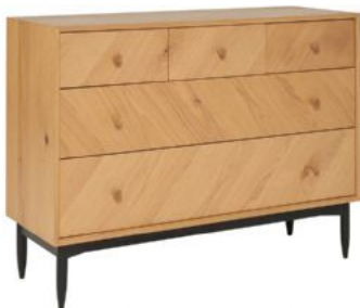
5 Drawer Wide Chest 113cm(w) 85cm(h) 46cm(d) was £1260 Sale from £999